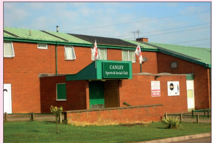
The club as it was in its heyday

The "temporary" wooden hut, which had served the club members