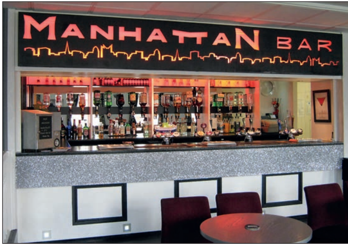
The new Manhattan Bar.