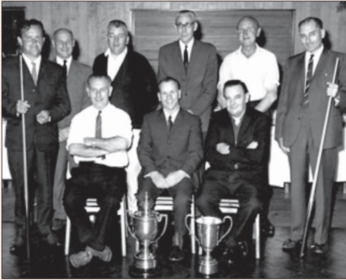
One of the club's billiard teams with their trophies. As well as traditional billiards, bagatelle, an early form of bar billiards, remains popular in Coventry.